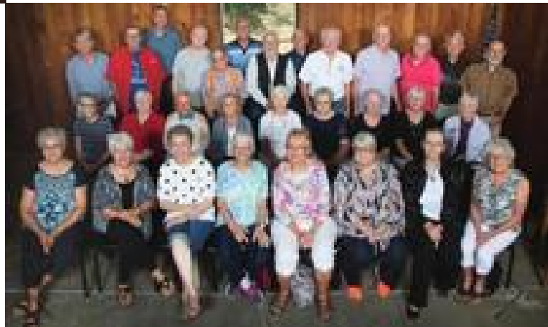
Class of '63