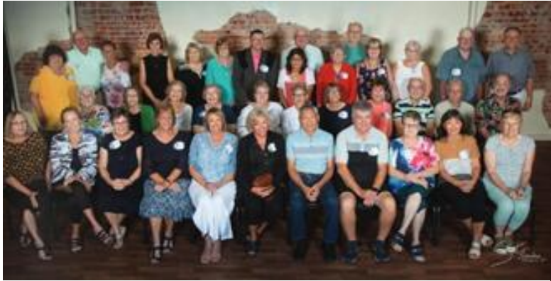
Class of '73