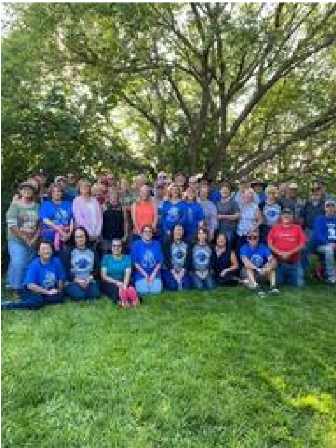
Class of '83